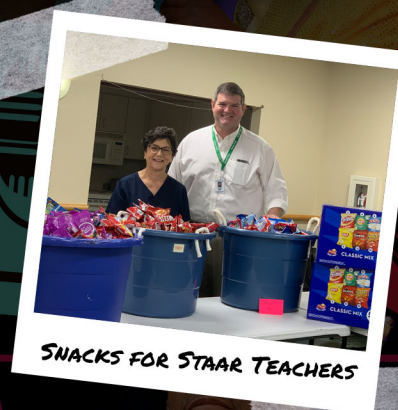
SNACKS FOR STAAR TEACHERS

Every year, members of the CISDEF Board rally to assemble snack buckets to distribute to CISD teachers during STAAR testing, which often falls during Teacher Appreciation Week. This small gesture shows our teachers that we support them and appreciate them for everything they do for CISD students.