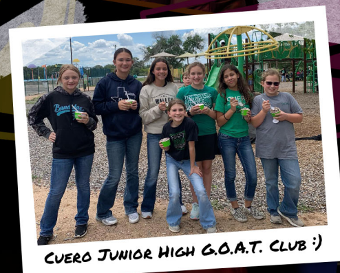
CUERO JUNIOR HIGH G.O.A.T. CLUB :)

The purpose of this grant was to encourage good behavior among Cuero Junior High School students by rewarding them with fun parties. These parties reward students for good behavior, excellent grades and good attendance. Students can earn an incentive every 6 weeks. Most recently, students were rewarded with ice cream in the park provided by Green Cow Creamery.